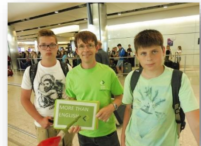
Staff meet students at the airport